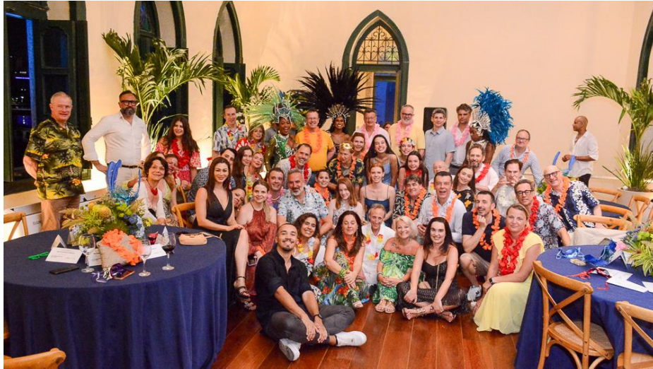
Everyone enjoying the Saturday Tropical Party at Ilha Fiscal

The Rio de Janeiro Assembly was an incredibly colourful and vibrant Assembly!